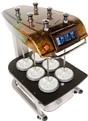
Silver Award: Hanson's Vision Classic 6 Dissolution Tester