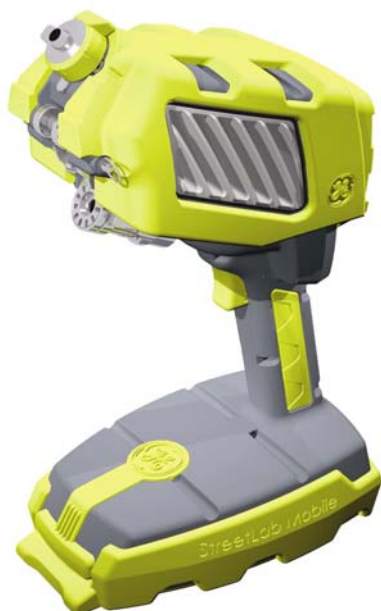
Silver Award: GE Security's StreetLab Mobile Raman Spectrophotometer