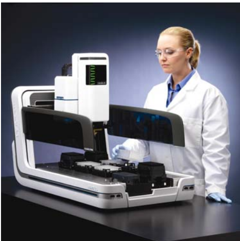
Gold Award: Hamilton's Microlab Nimbus Automatic Pipettor