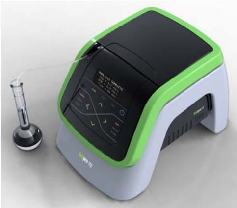
Bronze Award: Aqua Diagnostic's PeCOD L100 Analyzer