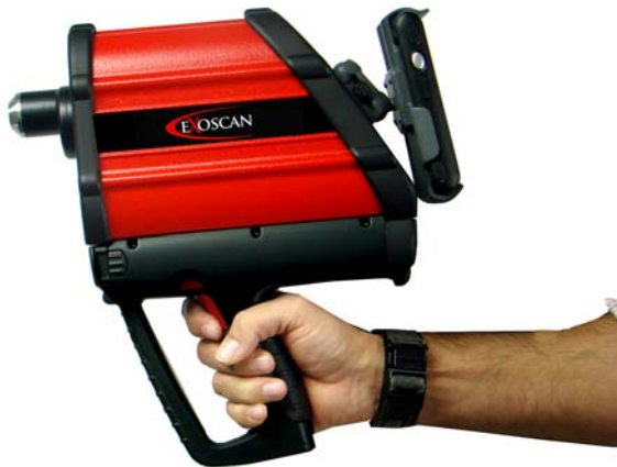
Bronze Award: A2 Technologies' Exoscan FT-IR